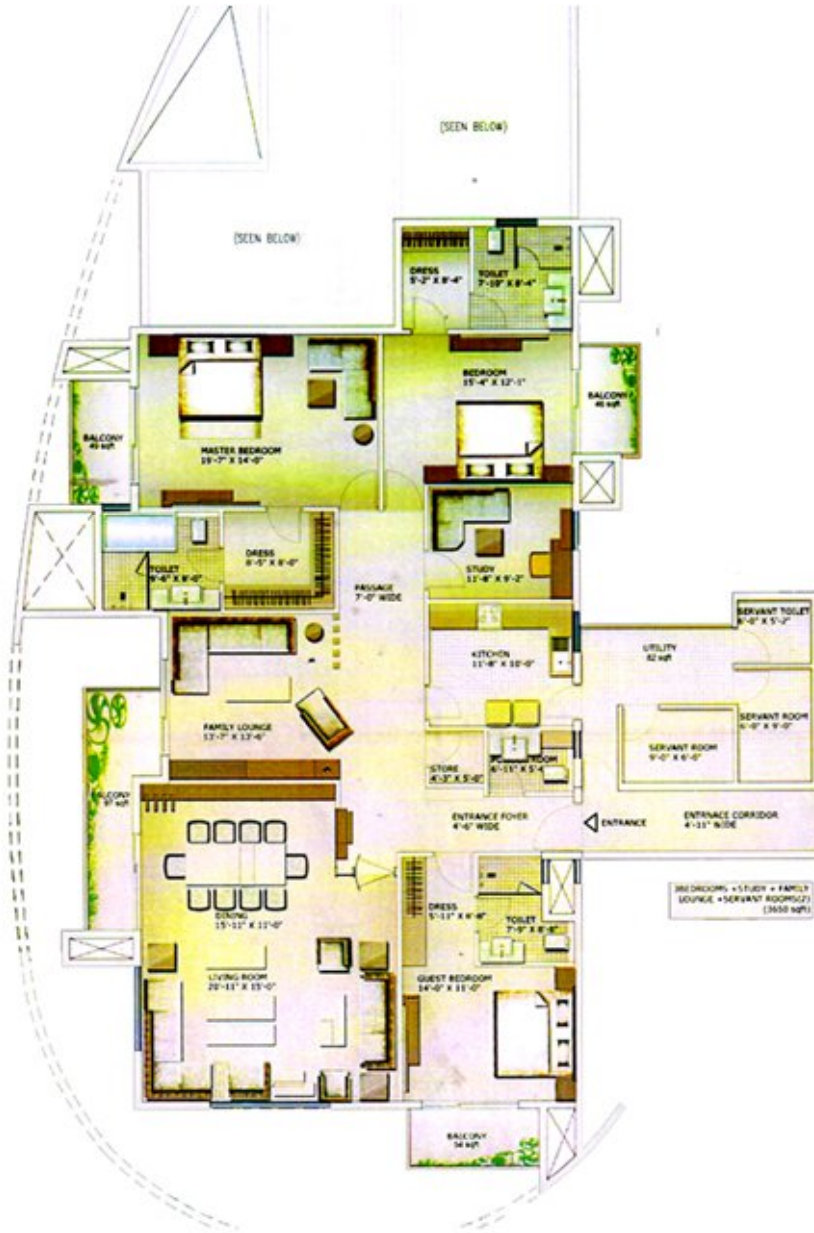
Floor Plan : 3650sqft